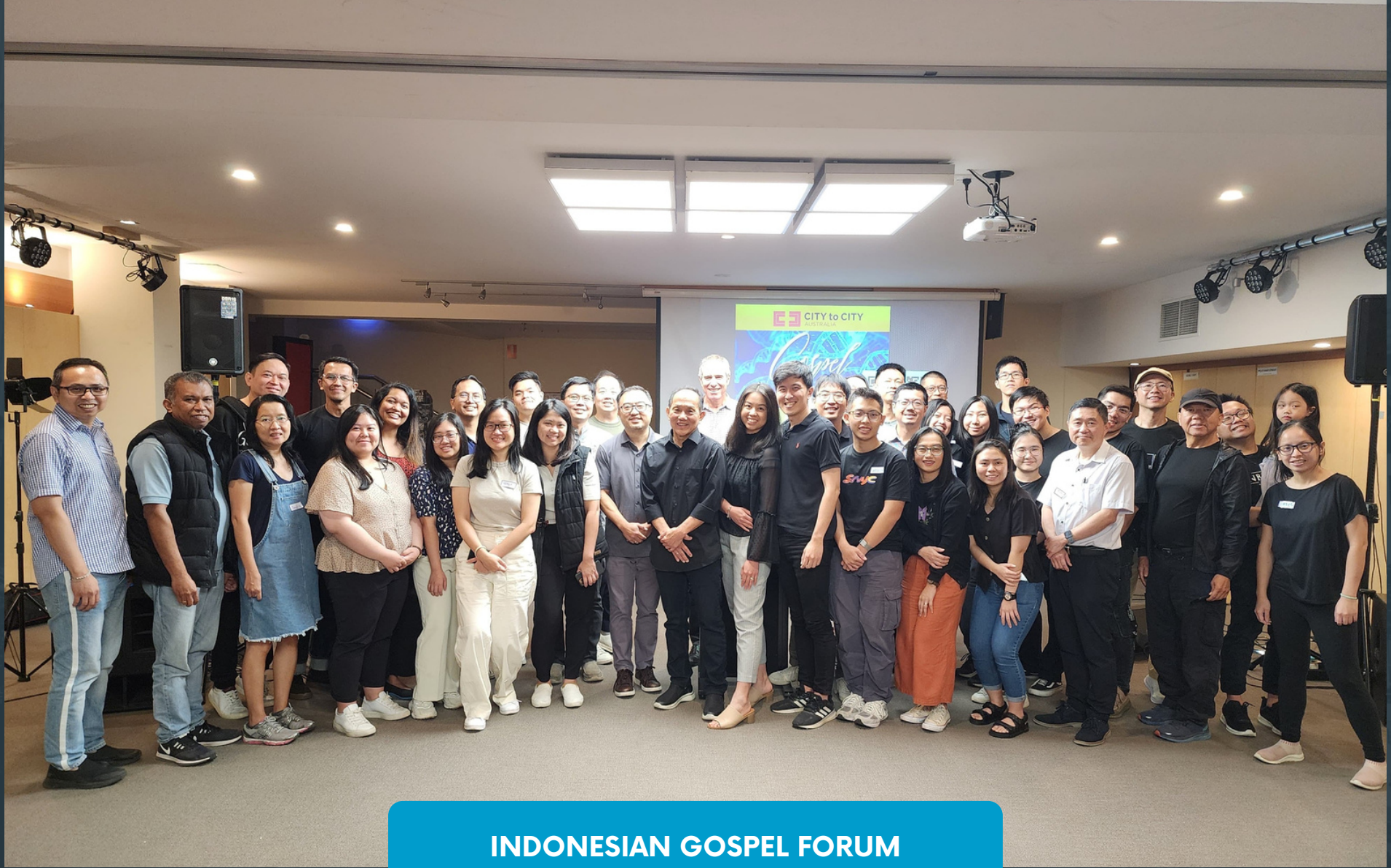
INDONESIAN GOSPEL FORUM MARCH 2024