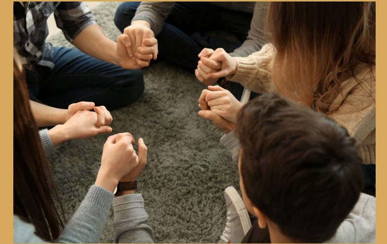
COHORT for gifted evangelists