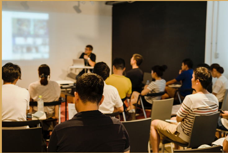
WORKSHOPS for the whole Church