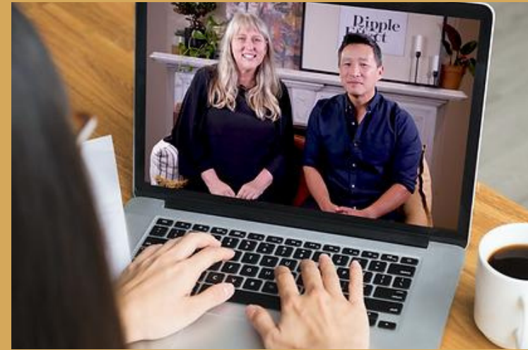
COURSE for small groups