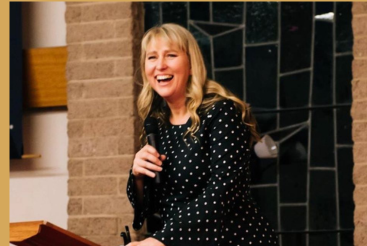
INCUBATOR for the Senior Leadership Team